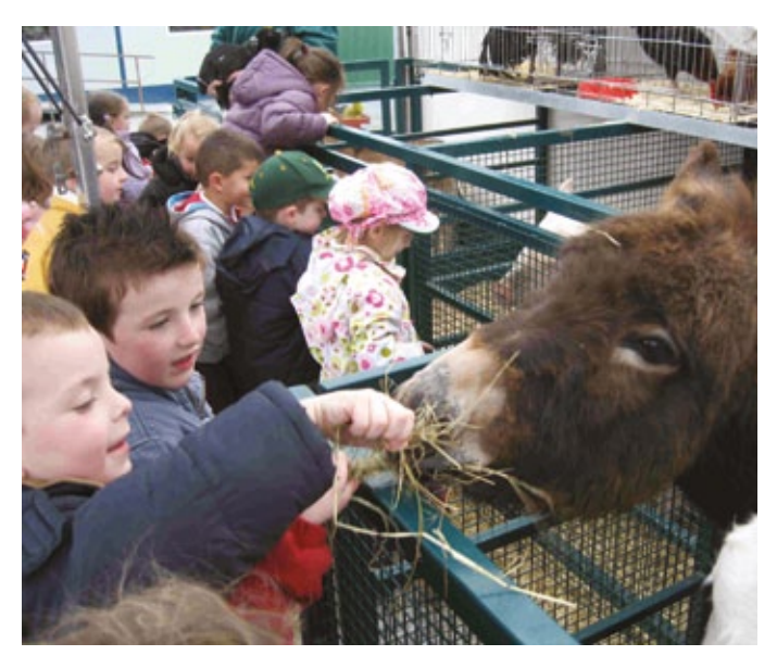
Caption above: Visitors to Agri Aware's Mobile Farm enjoy feeding the animals

Agri Aware's Mobile Farm continued to be hugely popular with primary schools, festivals and public events throughout 2012. In addition to visiting schools nationwide, the Mobile Farm also visited a number of public festivals, including the Waterford Harvest Festival and the Galway Races.